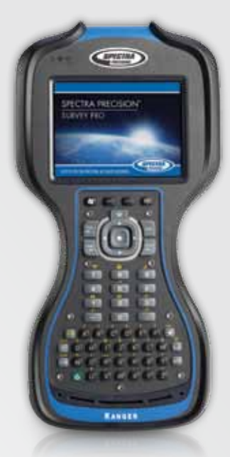
Spectra Precision Ranger 3